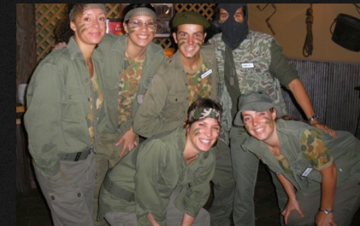
Rainforestation F&B Staff

Professional actors host the evening event in the rainforest – M*A*S*H characters Sgt Major and Hotlips Houlihan greet on arrival, entertain and coordinate your troupes throughout the evening on their action packed 'Tour of Duty' in the tropical rainforest.